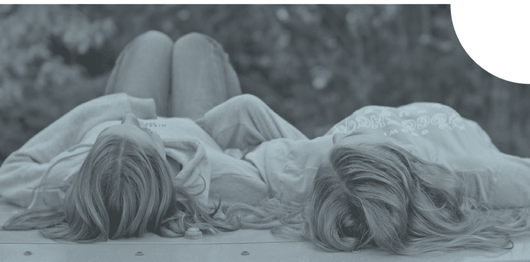
Girls' Stories by Aga Borzym (both photos)