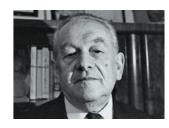
The Big Chief