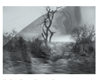
Light in the Shadow